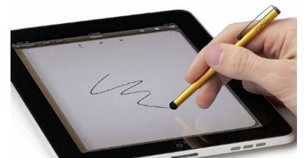
iPad with stylus