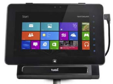
Windows Surface Pro tablet with Tobii eye-gaze system

Each device comes with in-built accessibility features that can assist with vision, hearing, and physical difficulties. These features vary according to the brand and model. Some examples include enlarging text, zoom, captions, and voice command.